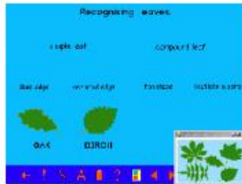
MAKING A SIMPLE KEY TO RECOGNISE LEAVES