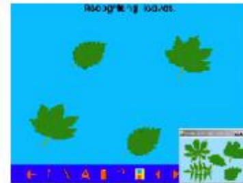
MATCHING PAIRS - NO TEXT

Other New Screen topics in this pack include: