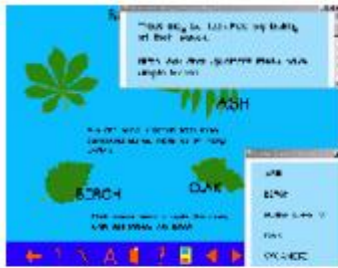
MAKING A FACT SHEET ABOUT LEAVES